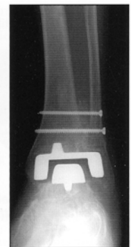
X-ray after surgery, with prostheses in place