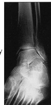
X-ray before surgery

From a brochure "Restoring the Joy of Motion" by DePuy Orthopaedics Inc. I am displaying an example of an X-ray before surgery and after surgery with prostheses in place.